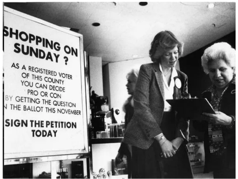
Bergen County [New Jersey] voters voted to keep the county's blue laws that limit shopping on Sundays.