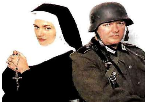
A wolf in wolves' clothing

The billboard on the wall full of Nazi locations and info from the deciphered enigma codes. You could see the entire German communication system.