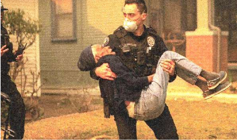
Do you see the two policemen? A 100 year old lady is carried away from the conflagration.

“No scientific theory can explain the steady march of evil workers under the generalship of Satan. In every mob wicked angels are at work... Very soon the wickedness of the world will have reached its limit.” UL 334.