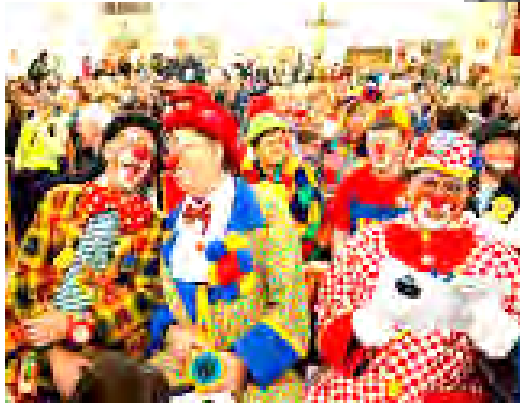
The laughing congregation. Do you see the cross of Calvary?