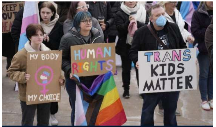
People gather in support of transgender youth during a rally at the Utah State

“At the coming of Christ the wicked are blotted from the face of the whole earth—consumed with the spirit of His mouth and destroyed by the brightness of His glory. Christ takes His people to the City of God, and the earth is emptied of its inhabitants. ‘Behold, the Lord maketh the earth empty, and maketh it waste, and turneth it upside down, and scattereth abroad the inhabitants thereof.’ Isa. 24:1,3,5,6.