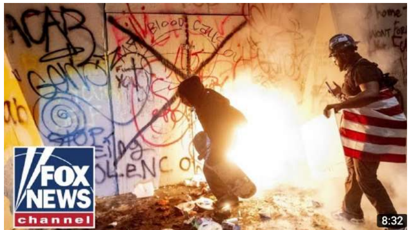
“As it was in the days of Lot.”

Every 'demon from hell' has been 'turned loose' in society, Franklin Graham says