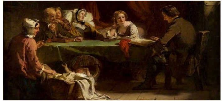
Hearing the Bible read on Sunday during the Sunday Blue Law.

“When the legislature frames laws which exalt the first day of the week, and put it in the place of the seventh day, the device of Satan will be perfected. ” (RH 4-15-‘90.) Amazing!