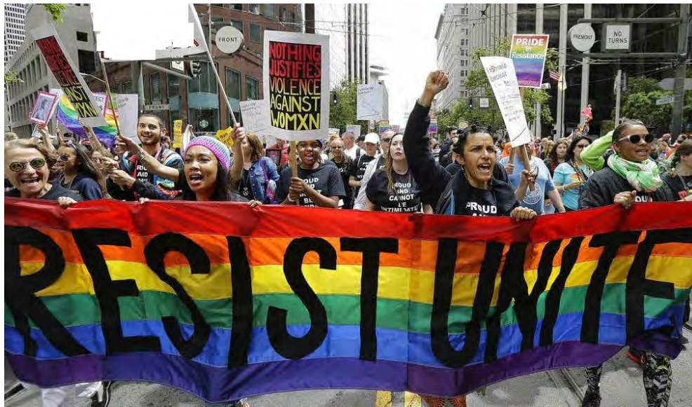
Here they come - ready or not.

“At night, it's a completely different vibe than during the day,” he asserted. ‘You see vagrants come there. Some of them are dealing with mental and health [crises]. There was an ambulance that was called yesterday. If anybody needs help they actually have to leave the physical “zone” and return to the U.S. to get help.’