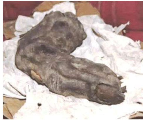
The finger of a giant who lived before the flood. Do you see his finger nail?

“For seven days after Noah and his family entered the ark, there appeared no sign of the coming storm. During this period their faith was tested. It was a time of triumph to the world without. The apparent delay confirmed them in the belief that Noah’s message was a delusion, and that the Flood would never come... They gathered in crowds about the ark, deriding its inmates with a daring violence which they had never ventured upon before.