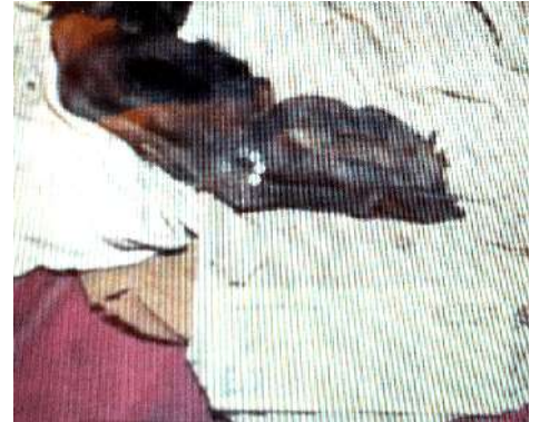
Another finger of a giant. The piece of paper money shown here is 6 inches long. What this giant actually saw is described on this awesome page.