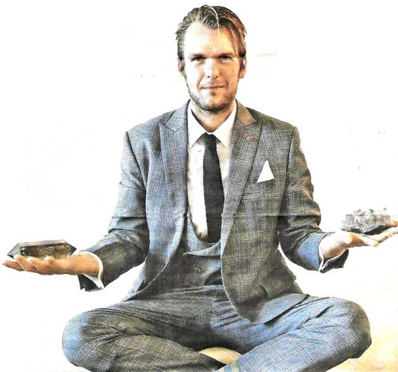
They like magical crystals

Hope: Do smiling fiends sell sparkling crystals for $10,000 each to poor rich souls who are empty? Money, fast cars, adultery, and muscles fail to bring the sweet peace that dear Jesus gives. How will crystals help lead liberal atheists and evolutionists into spiritualism - to go along with the devil's religious law? In this letter, you'll get a hint.