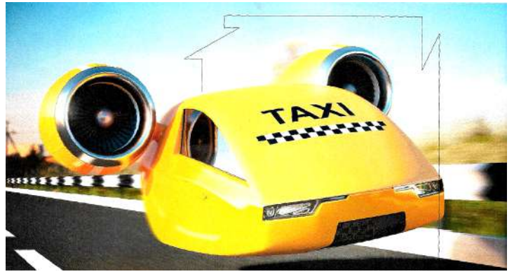
The World Tomorrow. What will it be like?

“It is impossible to give any idea of the experience of the people of God who will be alive on the earth when past woes [persecution] and celestial glory will be blended. They will walk in the light proceeding from the throne of God. By the means of the angels there will be constant communication between heaven and earth. And Satan, surrounded by evil angels, and claiming to be God, will work miracles of all kinds to deceive, if possible, the very elect. God’s people will not find their safety in working miracles, for Satan would