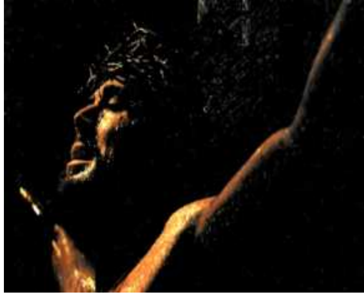
"Hope thou in God, for on Calvary's cross a complete sinner looks up to the One who died to save him, he may rejoice with fulness of joy; for his sins are pardoned." SD 222. Praise God friend! Praise

"Little did the gay, thoughtless" youth, as he went out from his father's gate, dream of the ache and longing left in that father's heart. When he danced and feasted with his wild companions, little did he think of the shadow that had fallen on his home. And now as with weary and painful steps he pursues the homeward way, he knows not that one is watching for his return. But while he is yet 'a great way off' the father discerns his form. Love is of quick sight. Not even the degradation "Hope thou in God, for on Calvary's cross a comp sacrifice was offered for you... Eternal joy—a life of of the years of sin can conceal the son undimmed happiness—awaits the one who surrenders all to Christ." HP 262. "When at the foot of the cross the from the father's eyes. He 'had compassion, and ran, and fell on his neck' in a long, clinging, tender embrace.