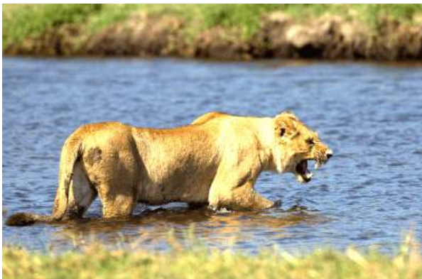
The Lion of the tribe of Judah is not like the "dumb dogs who cannot bark."

HIS ANGELS FOUGHT AGAINST THE DRAGON; AND THE DRAGON FOUGHT AND HIS ANGELS, AND PREVAILED NOT; NEITHER WAS THEIR PLACE FOUND ANY MORE IN