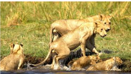
The Lion of the Tribe of Judah brings His little family safely to the Promised Land. The lovely Jesus will do the same for us.

“My jaw dropped,” she recalls. She said to herself, “They have to know! They have blinders on!”