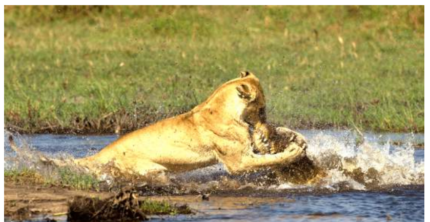
As the angels of God did to the sodomites in Sodom, the Lion of the tribe of Judah makes the eyes of the monster so that he can't see what he's doing. Then what happens?