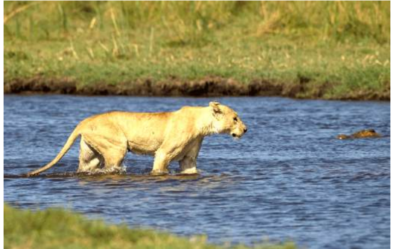
The Lion of the tribe of Judah leads the precious family of little ones safely across the waters of strife to the promised land. Do you see a dragon anywhere?