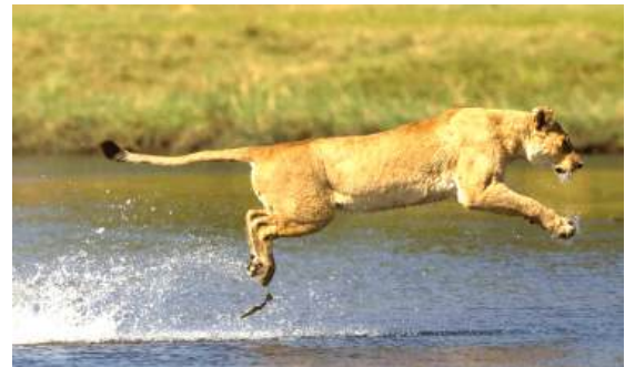
Unlike the "hireling" shepherds who leave the flock and flee, the Lion of the tribe of Judah flies to the attack against the dragon.

HEAVEN. AND THE GREAT DRAGON WAS CAST OUT, THAT OLD SERPENT, CALLED THE DEVIL, AND SATAN, WHICH DECEIVETH THE WHOLE WORLD: HE WAS CAST OUT INTO THE EARTH, AND HIS ANGELS WERE CAST OUT WITH HIM. AND I HEARD A LOUD VOICE SAYING IN