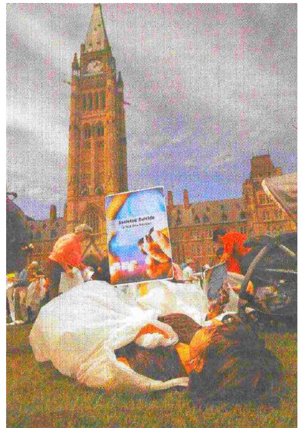
Do you see the protesters in body bags on the ground? The Catholic paper Our Sunday Visitor reports that they're having a "DIE IN." By God's grace, I'll show you some of the documentation in my next letter.

"Soon there appears in the east a small black cloud, about half the size of a man's hand. It is the cloud which surrounds the Saviour and which seems in the distance to be shrouded in darkness. The people of God know this to be the sign of the Son of man. In solemn silence they