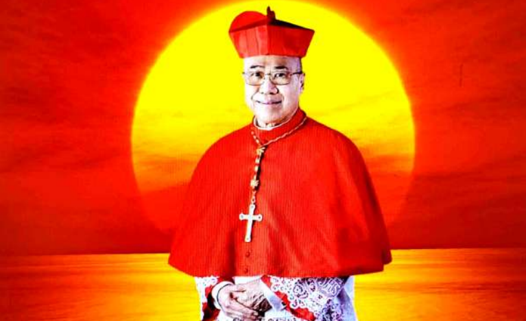
Catholic Cardinal: “Sunday Worship Strengthens Church and Community Life, and those who Deliberately Disregard it Commit Grave Sin.”

Dear SDA friends around the world, Greetings in the holy name of Jesus.