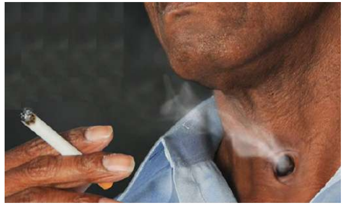
“Men did not reason. They were beyond reason.”

“By stubborn rejection of divine love and mercy, the Jews had caused the protection of God to be withdrawn from them, and Satan was permitted to rule them according to his will. The horrible cruelties enacted in the destruction of Jerusalem are a demonstration of Satan's vindictive power over those who yield to his control.