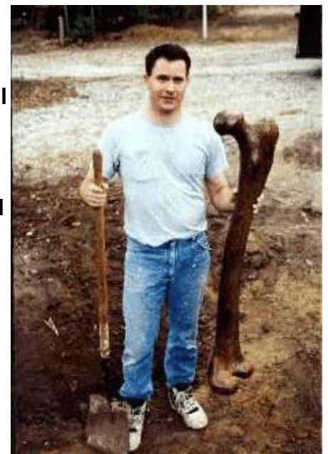
Found in Turkey - the giant leg bone of a man at the time of the flood, who was about 15 feet tall.

Hope: If your head dies, will he give your money back?