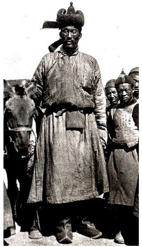
On an expedition for National Geographic, Roy C. Andrews photographed this giant in Mongolia. But he was a tiny one. He was only 7 feet 5 inches tall.

In a parable, we can look at the poor fiend! - fumbling around with a slippery bundle of blood-soaked nerves while many more connections must go to the brain, heart, and other places. There they are - lying there dying! All he can do now - as the clock is running out - is to grab a bloody tool while his eyeballs are popping out and the nerve bundles, arteries, veins, are getting stiff. There's the man's nearly dead body on the table, and there's the other man's nearly dead head. The clock is striking zero! All the poor thing can do now is to yank the clock off the wall, throw it across the room, and cry out - "AAAAAAAAAAAHhhhhh!!!!!!" as he falls on the floor.