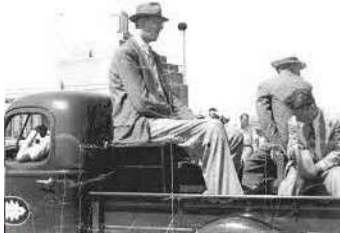
He can go places in the pickup truck. People are gathered around to see him.