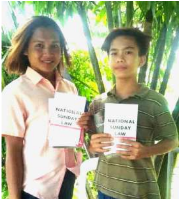
From the Philippines