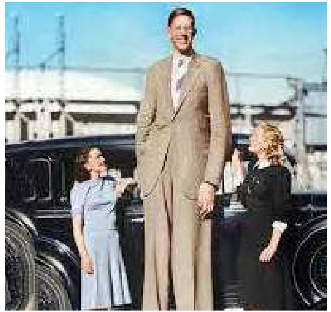
Do you see the little car? "There were giants in the earth in those days."