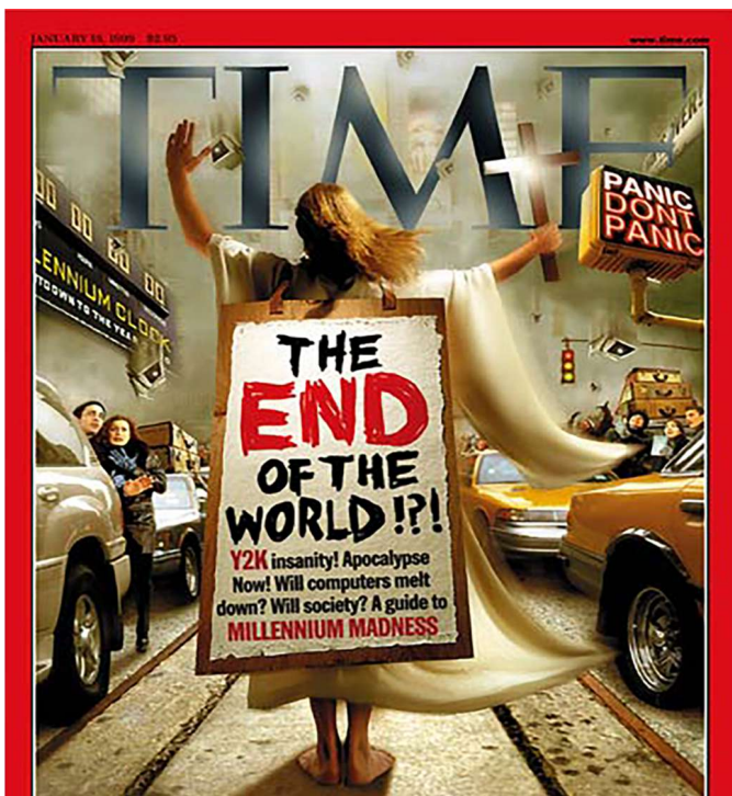
Why would TIME magazine put this on its front cover?

This magazine is entitled "Are We Alone?" It gives the Pentagon's UFO Report, and asks, "What are the 144 Mystery Objects?" And we ask, "Who are the 144,000 mystery people?" Hope: Will the searchers find what they're looking for? Will all their hard work pay off? Will they soon talk with beings from outer space? Will they talk with demons? Charity: What will they look like? What will they do?