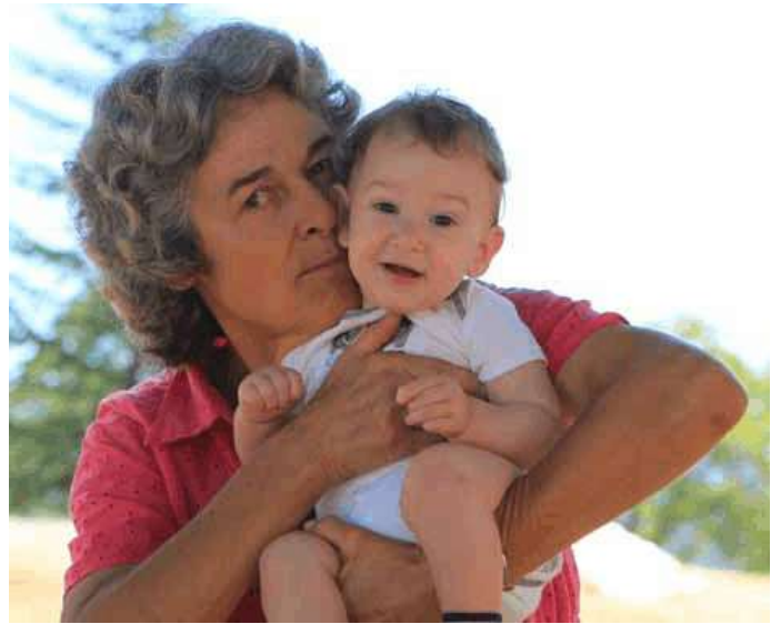
Hi Sweetheart! We love to see you!

“And then the great deceiver will persuade men that those who serve God are causing these evils. The class that have provoked the displeasure of Heaven will charge all their troubles upon those whose obedience to