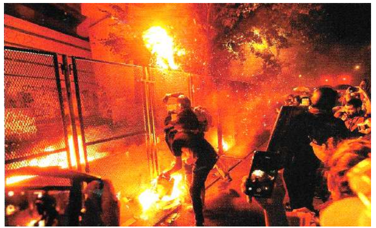
"Violence and destruction engulfed dozens of cities following the death of George Floyd. In Portland, BLM and Antifa sustained a nearly 50-day crime spree." A looting, killing, "fun-filled" crime spree is what wicked masses want. And the Roman Catholic controlled media were paid to report that the deadly riots were "mostly peaceful."