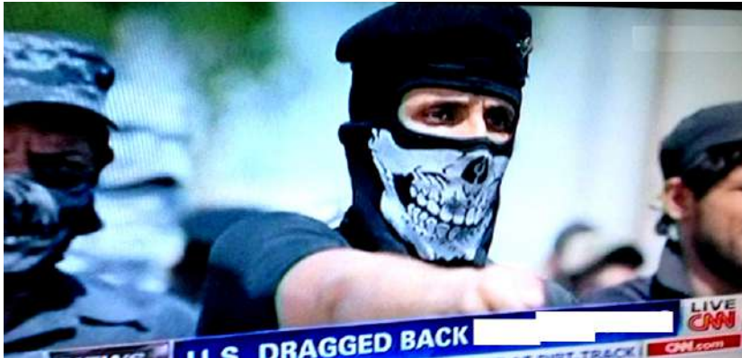
"They were chased by dragoons."

"According to the words of the prophet, a little before the year 1798 some power of satanic origin and