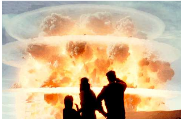
Nuclear power. Will it be used in the Battle of Armageddon?

Meanwhile, the prophet of God said, "Suppose that today Christ should appear in the clouds of heaven, who would be ready to meet Him? Suppose we should be translated into the kingdom of heaven just as we are. Would we be prepared to unite with the saints of God, to live in harmony with the royal family? Have you made your peace with God? ... Are you seeking to help those around you?... God knows whether we are keeping His law in truth. He knows just what we are doing, just what we are thinking and saying. Are we getting ready to meet the King? When He comes in the clouds of heaven with power and great glory, will you be able to say, 'Lo, this is our God; we have waited for him, and he will save us?' (Isa 25:9). To those who can say this, Christ will say, 'Come up higher. Upon this earth you have loved Me. You have loved to do My will. You can now enter the Holy City and receive the crown of everlasting life.' Mar. 298." [Wonderful Jesus!]