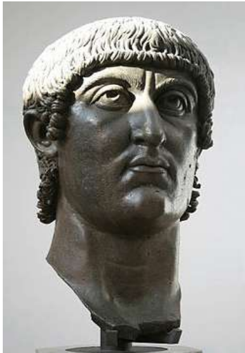
Bronze head of Constantine, from a colossal statue in the 4th century.

“The shock’ of the earthquake ‘was instantly followed by the fall of every church and convent, almost all the large public buildings, and more than one fourth of the houses. In about two hours after the shock, fires broke out in different quarters, and raged with such violence for the space of nearly three days, that the city [Lisbon] was completely desolated. The earthquake happened on a holyday, when the churches and convents were full of people, very few of whom escaped... The terror of the people was beyond description. Nobody wept; it was beyond tears. They ran hither and thither, delirious with horror and astonishment, beating their faces and breasts, crying, ‘Misericordia! the world is at an end!’ Mothers forgot their children, and ran about loaded with crucified images. Unfortunately, many ran to the churches for protection; but in vain was the sacrament exposed; in vain did the poor creatures embrace the altars; images, priests, and people were buried in one common ruin.’ It has been estimated that ninety thousand persons lost their lives on that fatal day.” GC 306. But a much greater earthquake is coming during the 7 last plagues when the earth itself will heave up and down like the waves of the sea... when “the towers fall,” and mountain chains sink into the ground.