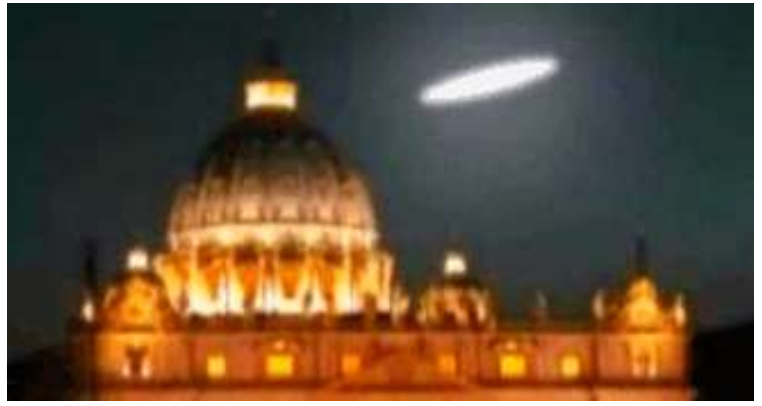
A picture of a UFO seen over the Vatican. Rome likes miracles. Here’s a UFO for them to enjoy.

In 1990 a new G.C. president was elected in Indianapolis. Some time later he had to be removed from that position. You saw him in the CCA video series. I watched and listened to his first great sermon. The title of his sermon was “Building Bridges.”