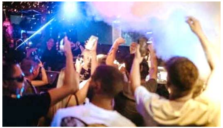
In the end of the world, church people rock, scream, and hop.