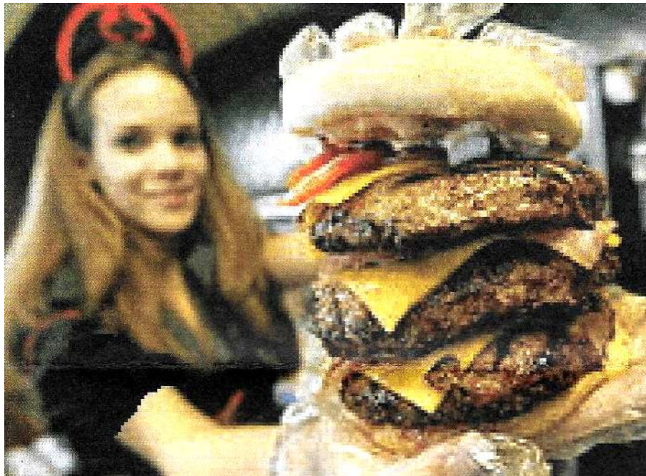
Have a $5,000 hamburger! Happy heart attack! Merry Christmas! In certain places, poor rich avatars can go to an exclusive hamburger joint where they can rejoice in their superiority over the poor, and buy fancy hamburgers for $5,000 each. They can chew on the dead carcasses and celebrate, “as it was in the days of Noah.”