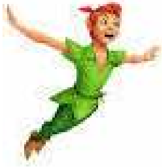
Peter Pan - part of the vast network of spiritualism - a supernatural, flying boy who never gets old.

The Bible quote on page one says, “Lest he walk naked and they see his shame.” Rev. 16:15. It was announced on the radio that a group sued the city of San Francisco because the city fathers built a big urinal for men in a city park. The wording conveyed the thought that everyone in there could see everyone else. The news commentator stated that the reason for the lawsuit against the urinal was not because of the men’s nakedness, but the objection to the urinal was because it discriminates against women.