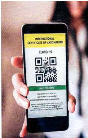
The New American , November 8, 2021

The picture on the left shows that in 1938 Germany, persecuted Sabbath-keepers were not worshipping the Nazi party. In our day, the vaccination instrument on the right shows that you can be persecuted for not worshipping the dragon party. "And he spake as a dragon." Rev. 13:11.