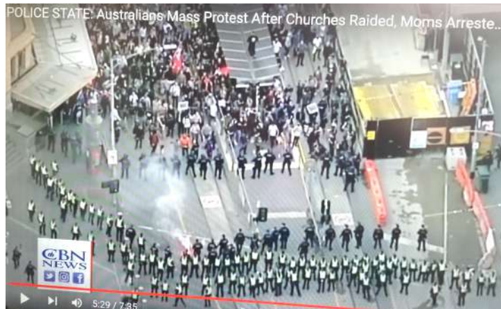
At the top of this picture it says, "Police state: Australian's mass protest after churches raided; Moms arrested."

This law was struck down because it prohibited states from authorizing sports gambling schemes. Should states authorize gambling schemes? Was that law struck down so that gambling schemes can flourish? Can you guess who is controlling the Supreme Court? Who's at the bottom of gambling? Gambling schemes began with "Bingo" in the Catholic churches and in the church yards where they had what they called bazaars. A bazaar is conducted in Catholic churches or church yards where they sell all kinds of stuff, and gamble. When I was a little boy my dear grandmother took me to a Roman Catholic church yard where they were having a bazaar and gambling with poker cards, a roulette wheel, and other devices of the devil.