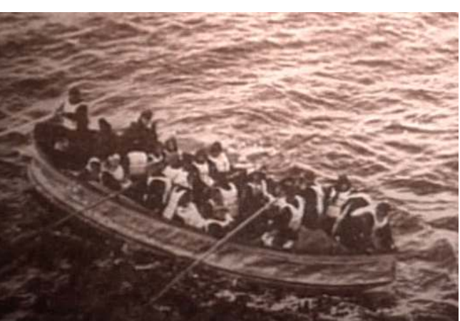
Some in the lifeboats. Some in the water. In ice water you have only about a minute or two to live. It was reported that before he went under, one pastor was pleading with people to give their lives to Jesus. Then he was gone. "And I heard a voice from heaven saying unto me, Write, Blessed are the dead which die in the Lord from henceforth: Yea, saith the Spirit, that they may rest from their labours; and their works do follow them. And I looked, and behold a white cloud, and upon the cloud one sat like unto the Son of man." Rev. 14:13,14.