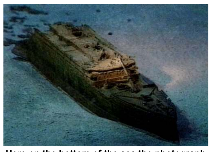
Here on the bottom of the sea the photograph shows the front of the great Titanic after she broke into two pieces.

sailed from South Hampton at noon and was expected to reach New York in just seven days with 2,228 people aboard.