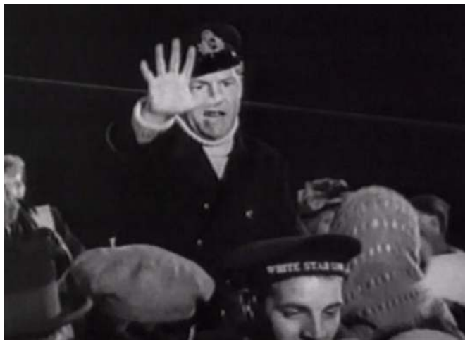
With only an hour to live, crew members of the Titanic decide who lives, and who dies. What would you do in that one hour? What would you think about?

With only about an hour left, crew members - like this one on the left - decide who lives, and who dies.