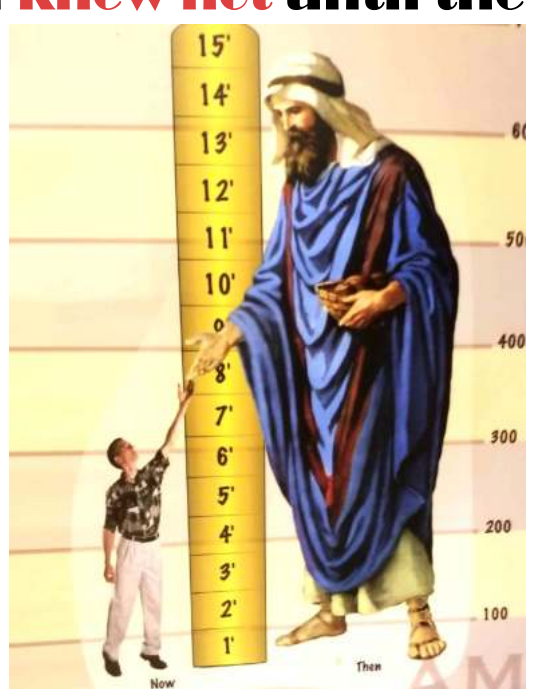
The prophet of God revealed that before the flood people were more than twice as tall as they are now. He could pick you up like a little doll and smile at you.