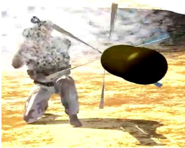
Magneto Hydrodynamic Explosive Munition

What kind of wars will God allow? In this picture, you get a glimpse of the future star wars. The prophet said, “The Lord is removing His restrictions from the earth... Those who are without God’s protection will find no safety in any place... Human agents are being trained and are using their inventive power to put in operation the most powerful machinery to wound and to kill.” CCh 335,336.