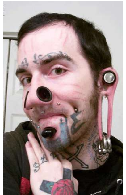
“As is was in the days of Lot.”

Likewise also these filthy dreamers defile the flesh... twice dead, plucked up by the roots; Raging waves of the sea, foaming out their own shame; wandering stars, to whom is reserved the blackness of darkness for ever... But ye, beloved, building up yourselves on your most holy faith, praying in the Holy Ghost, Keep yourselves in the love of God, looking for the mercy of our Lord Jesus Christ unto eternal life.”