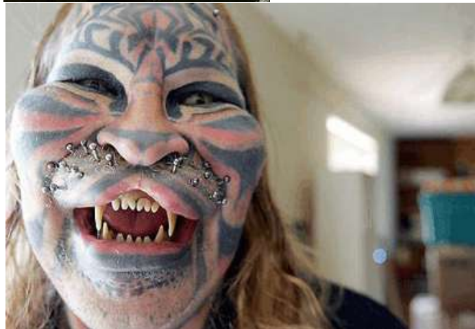
Is this what Noah saw?

Dear SDA friends around the world, Greetings in the holy name