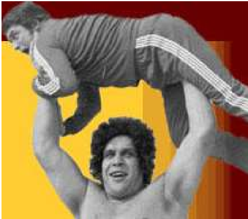
Andre the Giant is 7 feet 4 inches tall. He was born in 1946 and died in 1993. He weighed 520 pounds. Here he is with one of his dear friends.

“There were giants in the earth in those days... And God saw that the wickedness of man was great in the earth, and that every imagination of