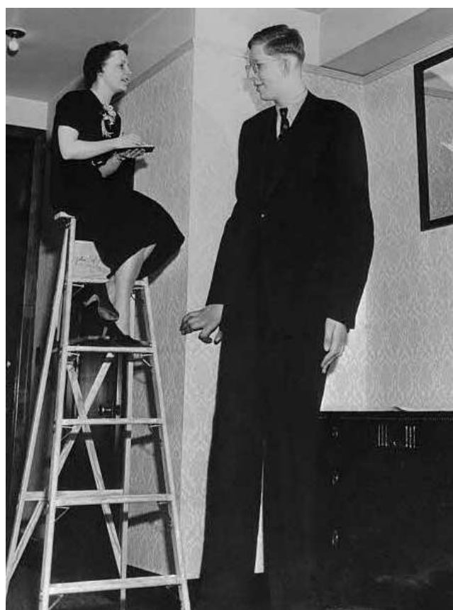
Here's Robert Wadlow. He's slightly over 9 feet tall with his shoes on. But people before the flood were as much as twice as tall as Robert. "There were giants in the earth in those days." Genesis 6:4.

them. But Noah found grace in the eyes of the LORD.”