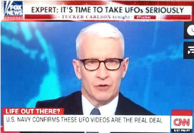
CNN reports that - U.S. NAVY CONFIRMS THESE UFO VIDEOS ARE THE REAL DEAL

Vernita's Corner: "Those who have trained the mind to delight in spiritual exercises, are the ones who can be translated and not be overwhelmed with the purity and transcendent glory of heaven." 2T p. 267