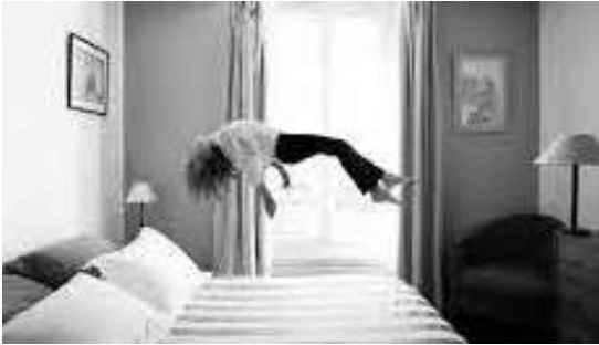
The devil demonstrates his power.

Raw meat on the day before probation closes. “They delighted in destroying the life of animals; and the use of flesh for food rendered them still more cruel and bloodthirsty, [as now] until they came to regard human life with astonishing indifference.” PP 91. “And he had power to give life unto the image of the beast, that the image of the beast should both speak, and cause that as many as would not worship the image of the beast should be killed.” Rev. 13:15. They’ll pass the death decree on God’s dear people with the kind of glee that 25,000 shouting slaves - with the demons of hell, and a can of beer - pack the stadium to see the horrible fight.