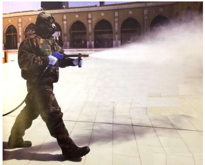
A new kind of fight with a new kind of weapon. What is it? Why is it? Who is it?

shall consume with the spirit of his mouth, and shall destroy with the brightness of his coming: Even him, whose coming is after the working of Satan with all power and signs and lying wonders, And with all deceivableness of unrighteousness in them that perish; because they received not the love of the truth, that they might be saved. And for this cause God shall send them strong delusion, that they