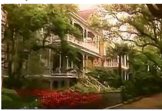
Galveston neighborhood - a picture of loveliness. "As it was in the days of Noah." Satan could hardly wait until he got permission to destroy thousands. An evangelist had come and was holding meetings - until they ran him out of town. They didn't realize that this act gave Satan the excuse he needed for God to allow him to wipe the city "off the map."