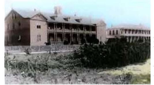
Just off the sand of the beach is St. Mary's orphanage.