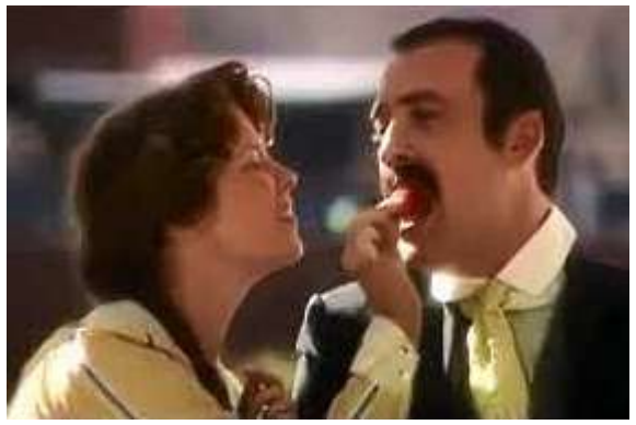
The two love-birds - as seen in the documentary on Galveston, entitled, "Isaac's Storm."