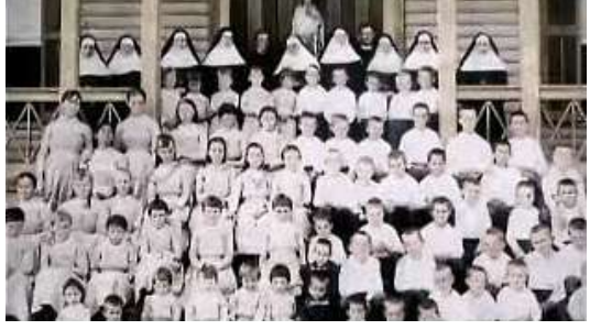
In the orphanage are 93 children and 10 nuns.