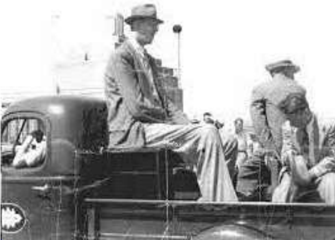
To go anywhere, 9 foot Robert Wadlow must depend on a pickup truck. He can't get inside the cab of any vehicle. People gather around to see him. Do you see the tiny little driver?

AND THAT EVERY IMAGINATION OF THE THOUGHTS OF HIS HEART WAS ONLY EVIL CONTINUALLY. AND IT REPENTED THE LORD THAT HE HAD MADE MAN ON THE EARTH, AND IT GRIEVED HIM AT HIS HEART. AND THE LORD SAID, I WILL DESTROY MAN WHOM I HAVE