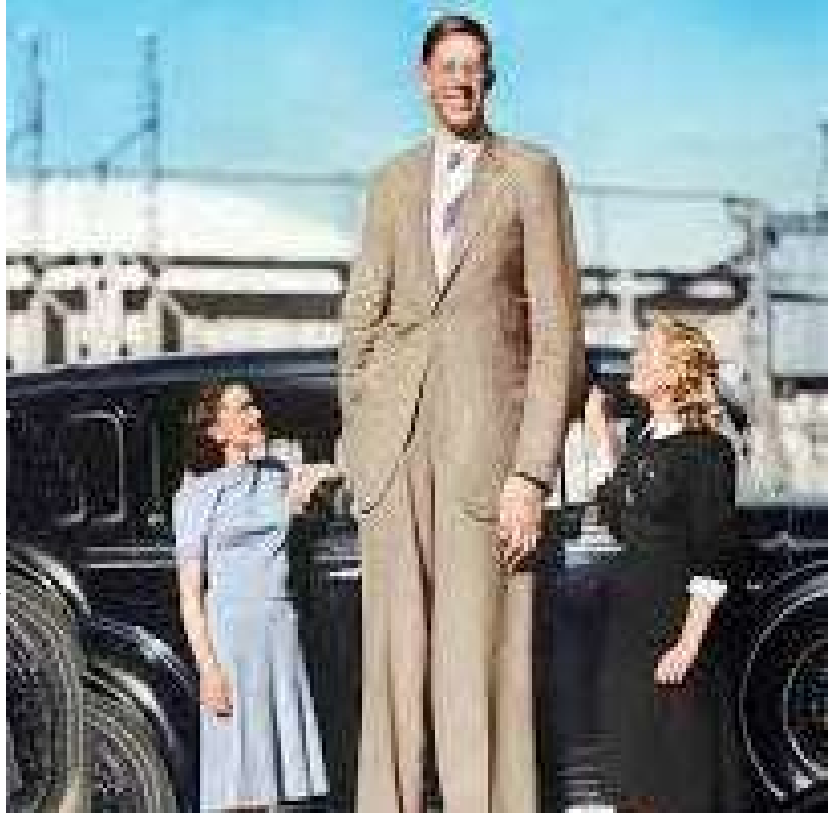
Do you see the little car? The ladies are full grown. "There were giants in the earth in those days." Genesis 6:4.

"AND GOD SAW THAT THE WICKED- NESS OF MAN WAS GREAT IN THE EARTH,