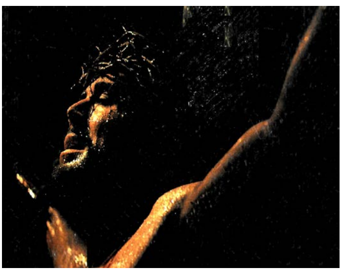
"Hope thou in God, for on Calvary's cross a complete sacrifice was offered for you... Eternal joy—a life of undimmed happiness—awaits the one who surrenders all to Christ." HP 262. "When at the foot of the cross the sinner looks up to the One who died to save him, he may rejoice with fulness of joy; for his sins are pardoned." SD 222. Praise God friend! Praise God!