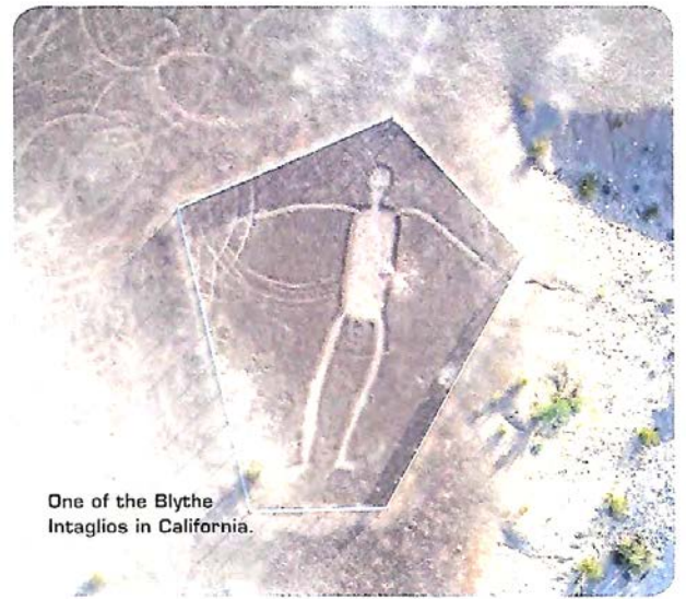
One of the Blythe Intaglios in California.

Hope: Why has anyone had a head that was shaped like the devil's head? Is the devil a pinhead?