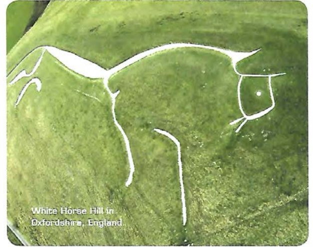
White Horse Hill in Oxfordshire, England.

They are huge! Some of them are larger than a football field. Scientists estimate that such figures carved in the earth are possibly thousands of years old. Yet, when they were made, no one could fly, and so no one could see them. Who made them? How did they know that they would be seen here in the last days? While rejecting God, many liberals and atheists are thinking that people from other planets could have had something to do with the beginning of our civilization. So we see that spiritualism and the supernatural are great tools to help push them "over the religious hump" to be able to accept the devil's Sunday law when it's enforced. Will SETI finally hear their signals in space? Could they come to us in space ships? It will be no great trick for the devil to fool both religious people, atheists, and kings - "For they are the spirits of devils, working miracles, which go forth unto the kings of the earth and of the whole world, to gather them to the battle of that great day of God Almighty." Rev. 16:14. "Fearful sights of a supernatural character will soon be revealed in the heavens, in token of the power of miracle-working demons." GC 624.