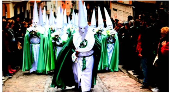
A great parade of secret society pinheads in the end of the world.

"Satan was once an honored angel in heaven, next to Christ. His countenance, like those of the other angels, was mild and expressive of happiness. His forehead was high and broad, showing great intelligence. His form was perfect; his bearing noble and majestic." EW 145.