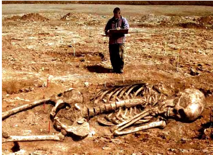
“There were giants in the earth in those days.” Gen. 6:4.