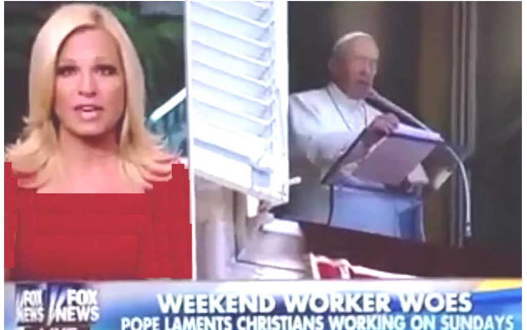
What will things like this lead to? Can you guess?

come down from heaven, having the key of the bottomless pit and a great