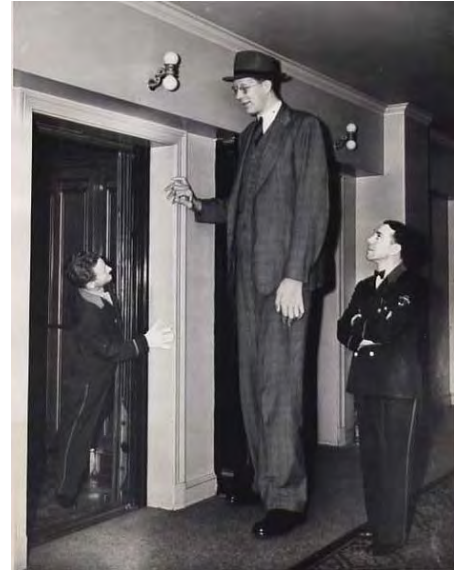
And here he is as the bellhop opens the elevator door to see who wants to come in.

4) A set of huge footprints was discovered near Mulgoa, south of Penrith, N.S.W. These prints, each measuring 2 ft long and 7 inches across the toes, are 6 ft. apart, indicating the stride of the 12 ft. giant who left them. These prints were preserved by volcanic lava and ash flows.