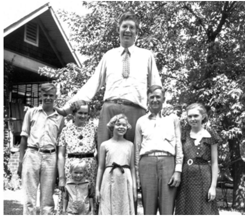
Here's 9 Foot Robert Wadlow with his family in Alton, Illinois. His left hand is on his father's shoulder, with his mother on his right. You can see pictures of him on the internet.