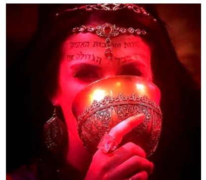
What's in the cup? Why is she drinking it?

Do you see the golden cup? Here's the great whore of Revelation 17. She's all fixed up to invite everyone to come and sin with her. But she doesn't tell them 1) who her real lover is, nor 2) what she looks like when she wakes up in the morning. 3) And she doesn't show them who's under the table. And, 4) she doesn't show them a video of themselves burning up in hell with her. In this letter, you'll get a hint as to what she's doing behind the scenes - leading to the enforcement of the mark of the beast.