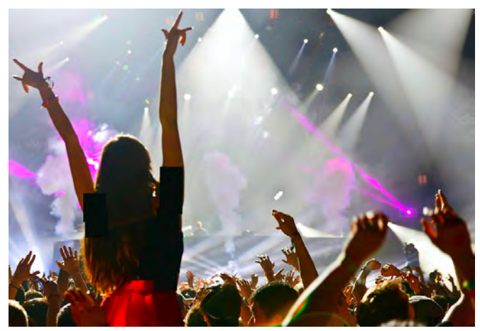
"The youth are swept away by the popular current." COL 54.

The scene that next passed before me was an alarm of fire. Men looked at the lofty and supposedly fireproof buildings and said: 'They are perfectly safe.' But these buildings were consumed as if made of pitch. The fire engines could do nothing to stay the destruction. The firemen were unable to