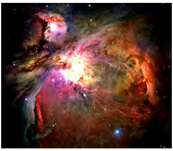
He made it all! At the farce of a trial and the torture of the cross; He knew that He made it all!

"For long hours of agony, reviling and mockery have fallen upon the ears of Jesus. As He hangs upon the cross, there floats up to Him still the sound of jeers and curses. With longing heart He has listened for some expression of faith from His disciples. He has heard only the mournful words, 'We trusted that it had been He which should have redeemed Israel.' How grateful then to the Saviour was the utterance of faith and love from the dying thief! While the leading Jews deny Him, and even the disciples doubt His divinity, the poor thief, upon the brink of eternity, calls Jesus Lord. [Praise God!]