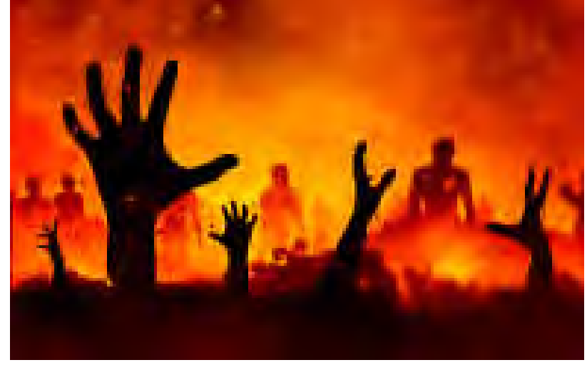
"The elements melt with fervent heat, the earth also, and the works that are therein are burned up. {2 Peter 3:10.} The earth's surface seems one molten mass—a vast, seething lake of fire." GC 672,673.