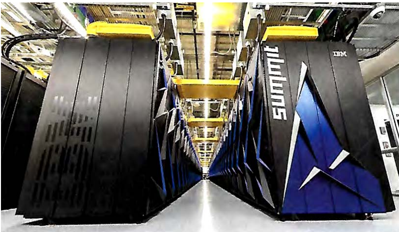
Here it is! "The Summit"

calculations per second? 6) This is where the gold contraption in this picture comes in. Concerning it, the article says, "Quantum computers operate on units of information called qubits. But they make mistakes when exposed to heat. So IBM built this gold-plated device, called a "dilution refrigerator," to cool its 50 qubit processor to a temperature of just a fraction above absolute zero. When properly chilled, the processor can crunch massive numbers at lightning-speed, and solve extraordinarily complex problems that would bog down traditional computers." 7) Finally, this picture below shows the great super trophy of the scientists! They call it "The Summit." Concerning it, the article says, "Oak Ridge National Laboratory unveiled its Summit supercomputer, which can make 3 billion billion [that's the same as 3 million trillion] calculations per second."