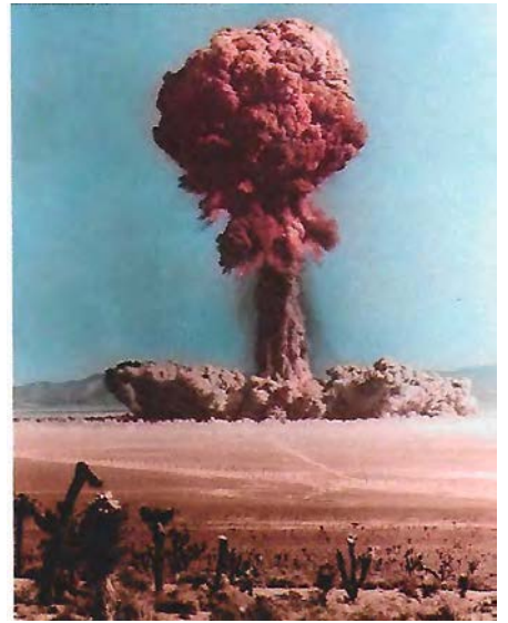
The Nevada desert