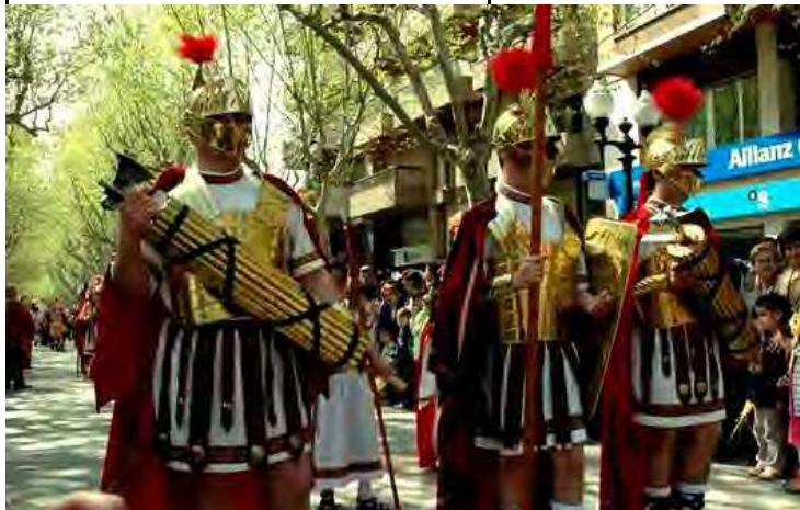
Here they are! Dressed like Roman soldiers, they carry the bound Fascii rods of Fascism = Communism.