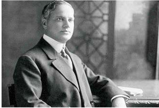
Benjamin Guggenheim - Born, October 26, 1865 in Philadelphia. Died April 15, 1912 (aged 46) on the Titanic.