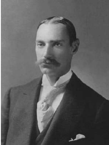
John Jacob Astor - Born July 13, 1864. New York. Died April 15, 1912 (aged 47) on the Titanic.

“When the Titanic left Queenstown to cross the Atlantic, there was a fire below the decks in the many tons of coal. If the ship had not sunk, it could have burned up. Not only were there so few lifeboats, but they had replaced the red emergency flares with white party flares, so that the only flares on board were the white ones. It was planned before they left port that if they had to blast off their flares, other ships would see that they were just having a party. There was just one thing after another, which I documented in my book.