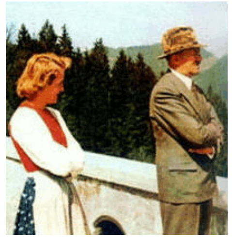
Eva and Adolf look at the beautiful mountains from the patio of the Berghof.

Here's the patio at the Berghof where Eva and her boyfriend visit, laugh, and look at the beautiful hills. He is one of the most powerful men on the face of the earth.