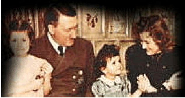
With some children at the Berghof

Do you comprehend that? If you do, it will help you to understand