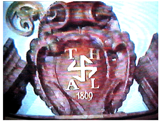
Young Adolf Hitler first saw this very swastika on the wall of this Catholic church where he sang as an altar boy. It influenced him to choose the swastika as his symbol.