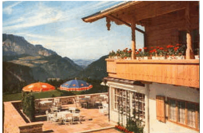
Here's the patio at the Berghof where Eva and her boyfriend visit, laugh, and look at the beautiful hills. He is one of the most powerful men on the face of the earth.