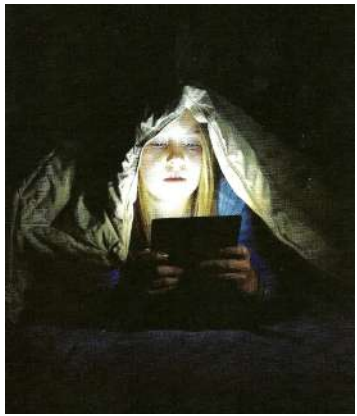
A slave in the end of the world.

Faith: Since January 20, it seems like mentally retarded demons from hell have been rushing through the land doing almost anything they can think of to destroy America while papal fiends stand cheering along with the book, Making America Catholic .