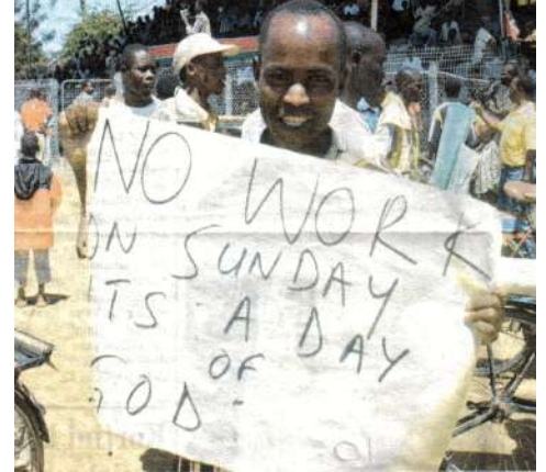
The sign says, “No work on Sunday. It’s a day of God.”

Vernita's Corner: "The presence of Christ alone can make men and women happy." AH 28