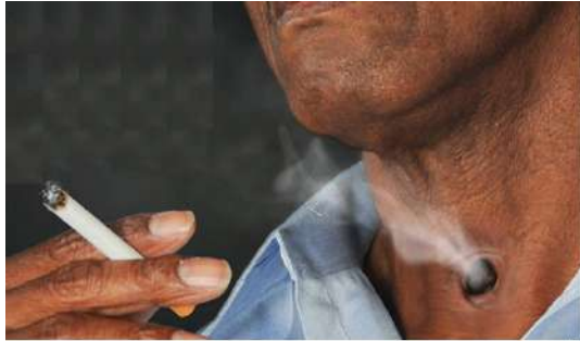
A slave in the end of the world.