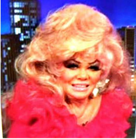
A slave in the end of the world

“The redeemed raise a song of praise that echoes and re-echoes through the vaults of heaven: ‘Salvation to our God which sitteth upon the throne, and unto the Lamb’ [Rev. 7:10].