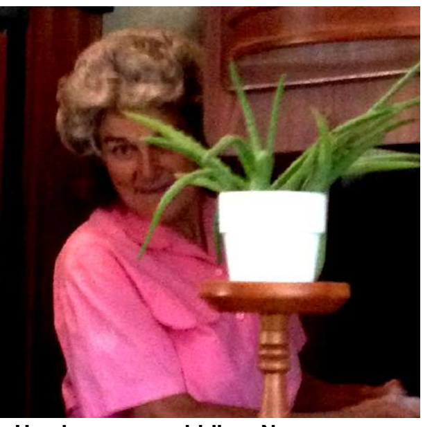
Here's someone hiding. No one can see her now. Hi Sweetheart! We love to see

They wouldn't dream of it. In the end of the world unlimited lust is rewarded! The picture above shows a tiny glimpse of the reward. The FDA also announced it is authorizing use of the MPV vaccine, in people younger than 18 years old. On a video, I heard the president of a cigarette company say, "Get them while they're young!" The vice president said, "How young?" The answer was - "High school, grammar school, kindergarten, babies, I don't care!"