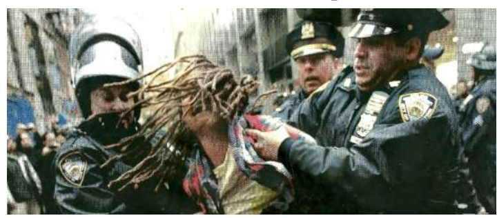
Mobs out of control - "as it was in the days of..."