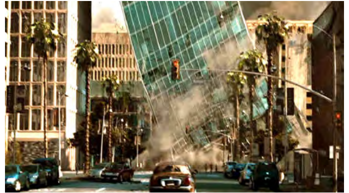
"And the cities of the nations fell." Rev. 16:19

Another prophet of God was shown the same thing, and pictured it thus - "With shouts of triumph, jeering, and imprecation, throngs of evil men are about to rush upon their prey [Now, the battle of Armageddon is in full swing] when, lo, a dense blackness, deeper than the darkness of the night, falls upon the earth. [Now the small and seemingly puny army gets help that shocks their enemies.] Then a rainbow, shining with the glory from the throne of God, spans the heavens and seems to encircle each praying company. The angry multitudes are suddenly arrested... The objects of their murderous rage are forgotten..."