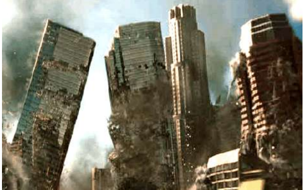
"Soon I heard the voice of God which shook the heavens and the earth. There was a mighty earthquake. Buildings were shaken down, and fell on every side." 1T 185.

pleasure in the death of the wicked.' Eze. 33:11. The Lord is 'merciful and gracious, long-suffering, and abundant in goodness and truth... forgiving iniquity and transgression and sin.' Yet He will 'by