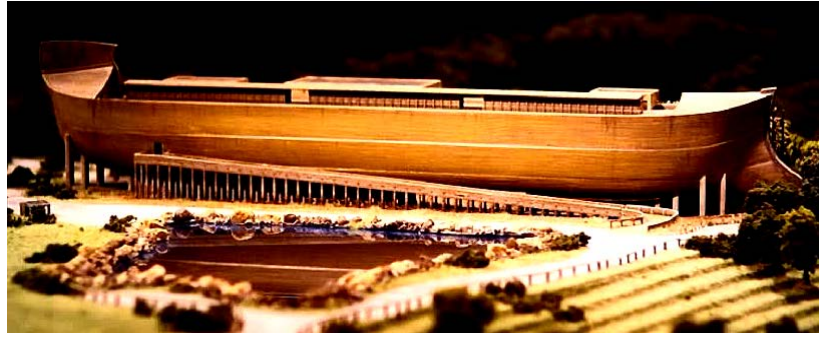
It was huge - nearly 2/3 the size of the Titanic.

door, which it was impossible for those within to close, was slowly swung to its place by unseen hands. Noah was shut in, and the rejecters of God's mercy were shut out. The seal of Heaven was on that door; God had shut it, and God alone could open it. So when Christ shall cease His intercession for guilty men, before His coming in the clouds of heaven, the door of mercy will be shut. Then divine grace will no longer restrain the wicked, and Satan will have full control of those who have rejected mercy. They will endeavor to destroy God's people; but as Noah was shut into the ark, so the righteous will be shielded by divine power.