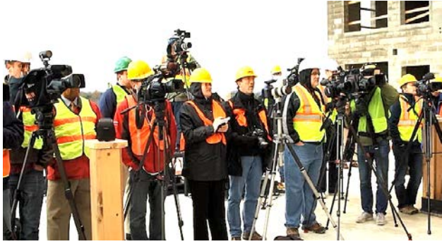
"They gathered in crowds about the ark, deriding its inmates with a daring violence which they had never ventured upon before." PP 98. Down here in our day, these are news reporters at the Ark in Kentucky.

"For seven days after Noah and his family entered the ark, there appeared no sign of the coming storm. During this period their faith was tested. [A similar thing will happen to us.] It was a time of triumph to the world without. The apparent delay confirmed them in the belief that Noah's message was a delusion, and that the Flood would never come. Notwithstanding the solemn scenes which they had witnessed—the beasts and birds entering the ark, and the angel of God closing the door—they still continued their sport and revelry, even making a jest of these signal manifestations of God's power. They gathered in crowds about the ark, deriding its inmates with a daring violence which they had never ventured upon before.