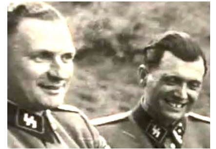
On the right is SS doctor Joseph Mengele, the happy “angel of death.” He’s so happy because he had the joy of medically torturing women and children. “And fire came down from God out of heaven, and devoured them.” Rev. 20:9.