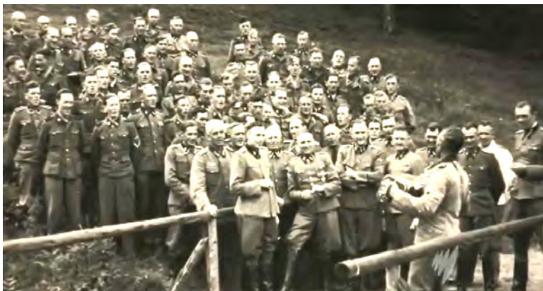
A joyful sing-along with leading Nazi killers at Auschwitz.. The smiling “angel of death” is the 5 th from the right. Do you see the accordion?