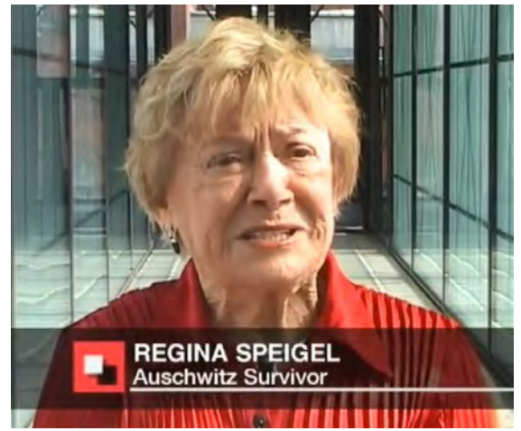
She said, “You look at these pictures and they look like... normal people!”