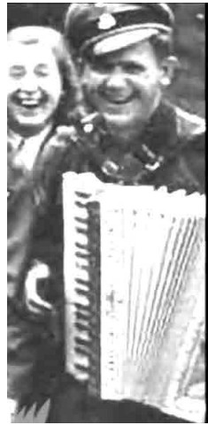
The church picnic?

“When the voice of God turns the captivity of His people [at the 5 th plague], there is a terrible awakening of those who have lost all in the great conflict of life. While probation continued they were blinded by Satan’s deceptions, and they justified their course of sin... They had neglected to feed the hungry, to clothe the naked, to deal justly, and to love