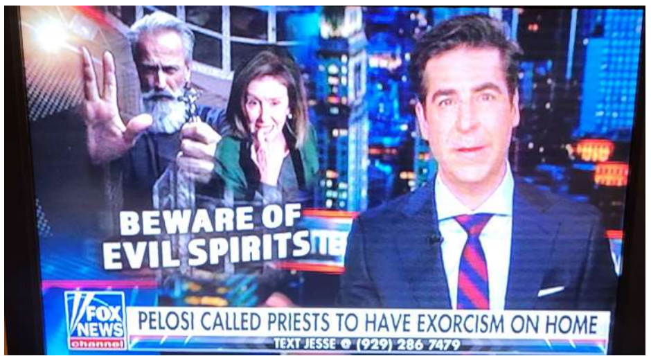
She’s a good Catholic, so she knew who to turn to.

come down unto you, having great wrath, because he knoweth that he hath but a short time.” Rev. 12:10-12.